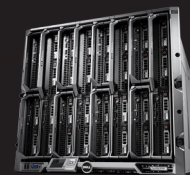
EXTREME SCALE INFRASTRUCTURE